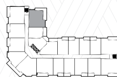
4TH TO 6TH FLOOR