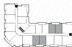
4TH TO 6TH FLOOR