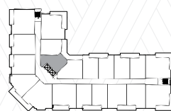
4TH TO 6TH FLOOR