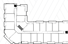
4TH TO 6TH FLOOR